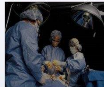
Figure 4. DESCRIPTION